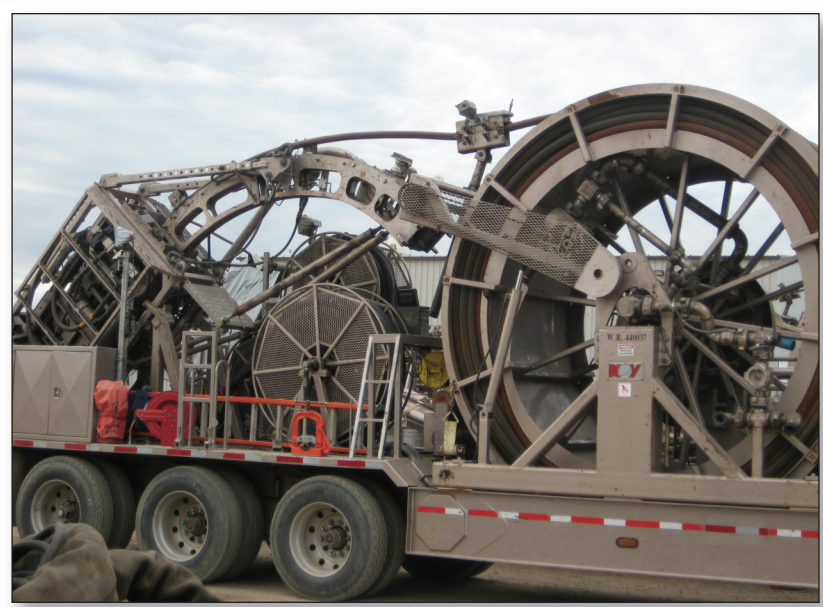
Coiled Tube Injector Rig