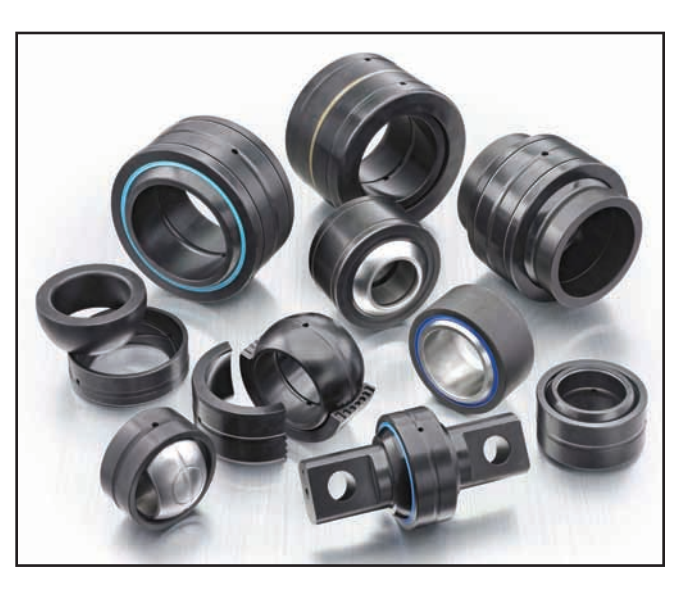
RBC Spherical Plain Bearings Built for Tough Applications