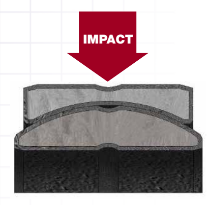
RBC ImpactTuff® Spherical Plain Bearings have a shock absorbing ductile core. This core absorbs impacts and impedes crack propagation through the ring.