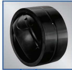
QuadLube® Spherical Plain Bearings for Bucket Hydraulic Cylinder and Arm Pivots