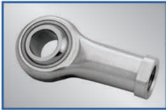
Rod Ends for Throttle Control Linkages