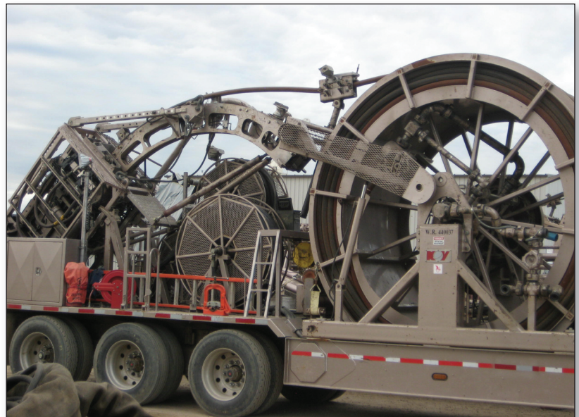
Coiled Tube Injector Rig