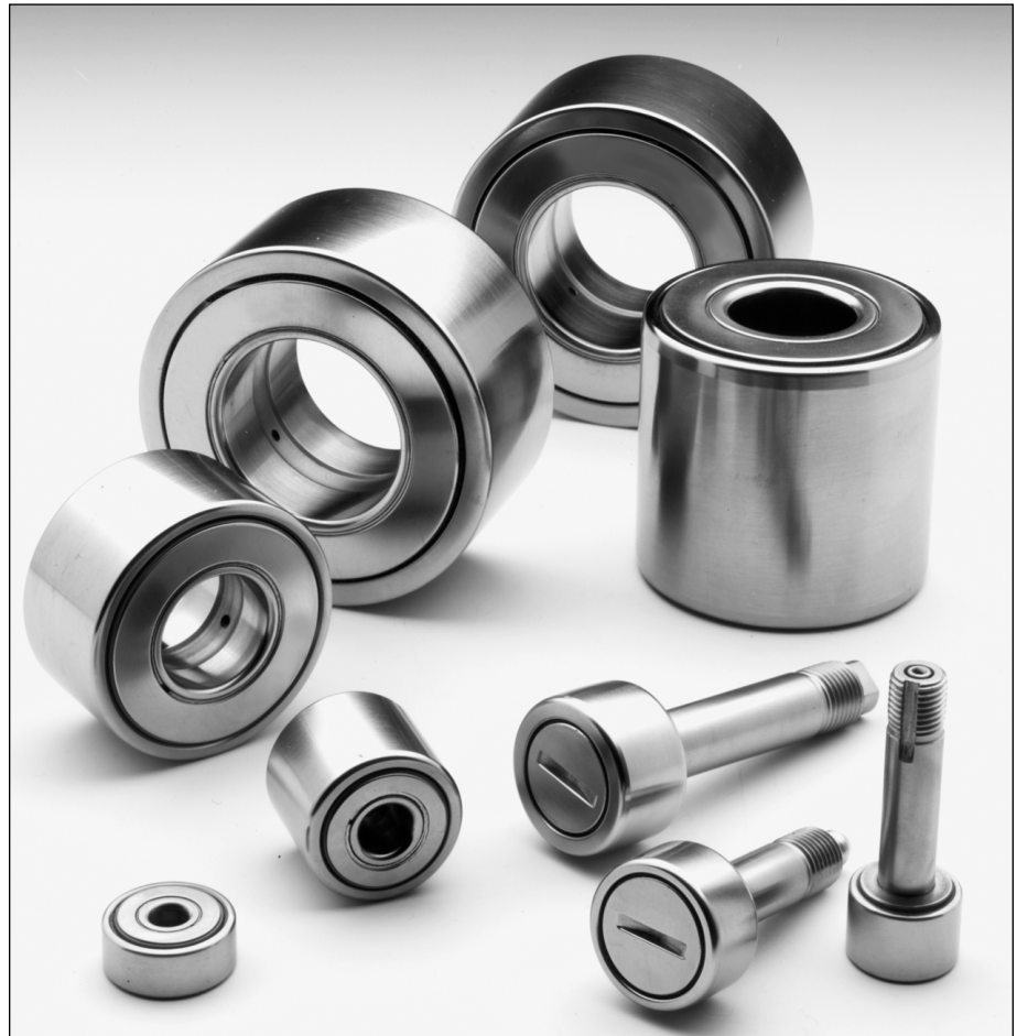
Outstanding corrosion resistance is the key to the reduced maintenance and extended service life of RBC's new AeroCres® grease bearings.

This dependable wing system solution helps airlines reduce their total maintenance and downtime costs, including flight delays and cancellations.